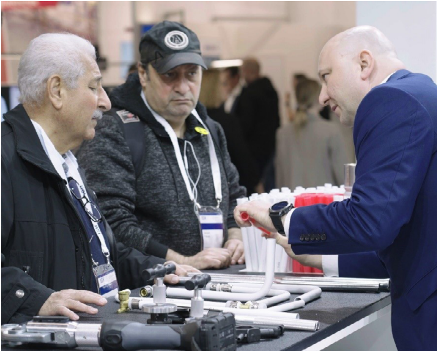
RIIFO Multilayer Plumbing System aroused the interest of many visitors

Visitors to the RIIFO booth were impressed by the company's comprehensive piping systems, especially RIIFO Multilayer Piping System. Multilayer Pipes in different sizes are available at RIIFO, providing multiple options for clients to use in different applications. With the advantages of both plastic and metal, RIIFO Multilayer Pipes certified by DVGW, ACS, AENOR and more are durable enough to work under different working conditions. As for fittings, RIIFO launched Multiprofile Press Fitting (U-TH-H-F-VX). With three O-rings, stainless-steel sleeves, and Leak Before Press (LBP), the design of this fitting is not only user-friendly but also reliable in preventing leakage. The piping systems displayed at the RIIFO booth aroused the interest of thousands of visitors over five days.