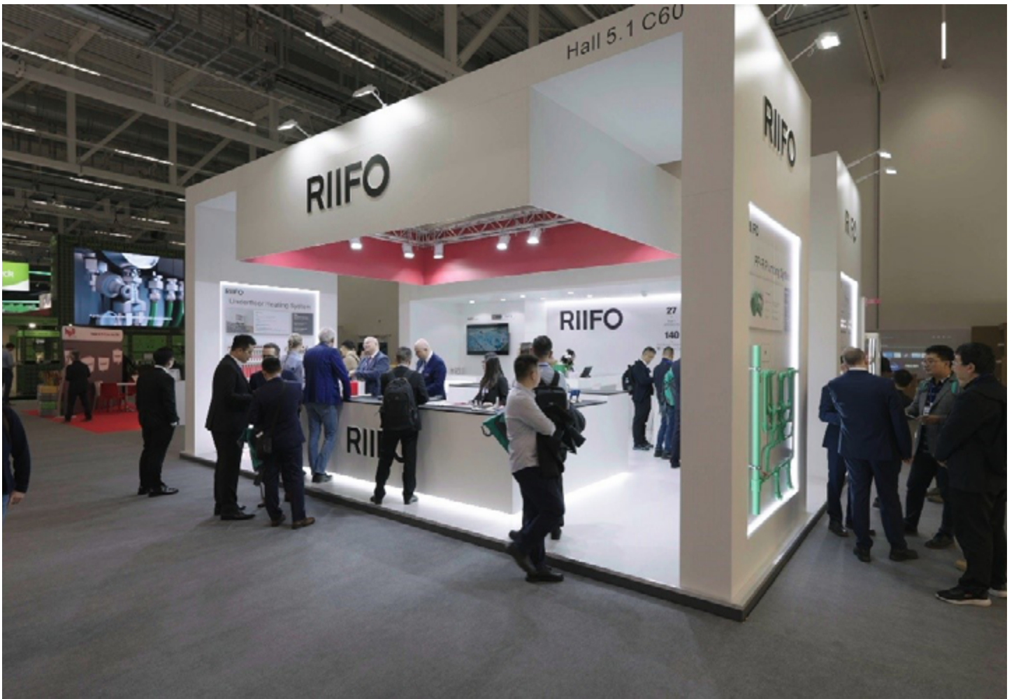
RIIFO booth at ISH 2023