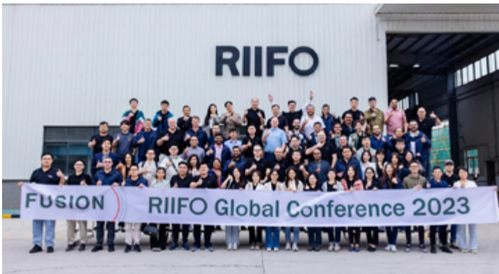
• RIIFO factory tour

In addition to the conference, all attendees also had a RIIFO factory tour, witnessing how RIIFO strives to deliver better piping products to clients through the aspects of R&D, manufacturing, and quality control.